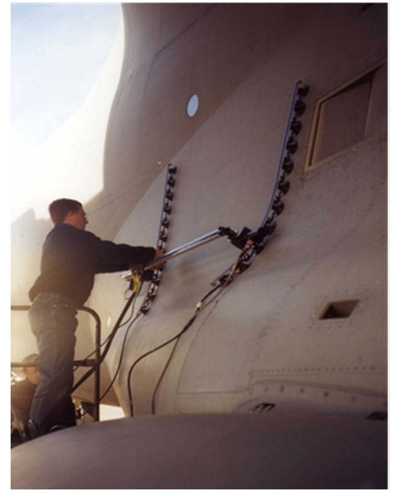
Catamaran scanner being installed on the fuselage of a C-17 aircraft.