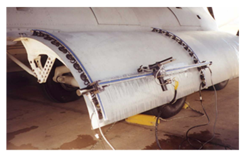
Catamaran scanner mounted on a C-17 landing gear cover.