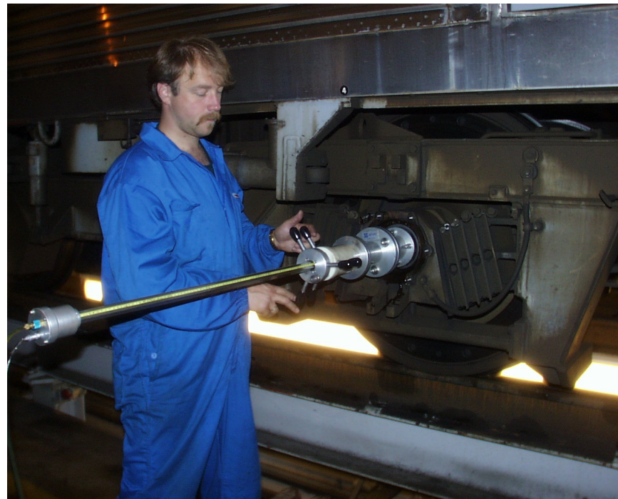
Current, semi automated, inspection of train axle with WesDyne equipment